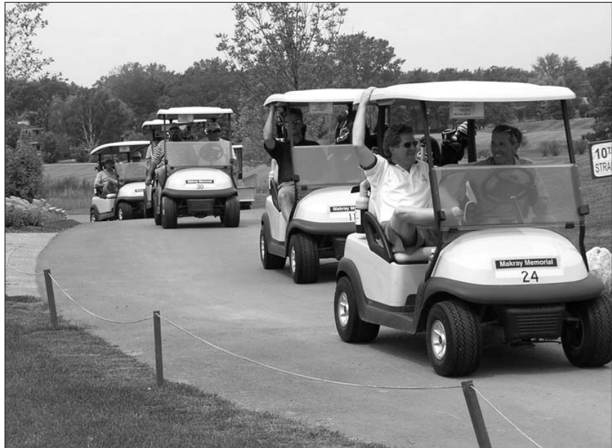
Golf carts roll along the Makray Memorial course, carrying some of the over 140 Builders Association members who helped raise money for the Builders Foundation.