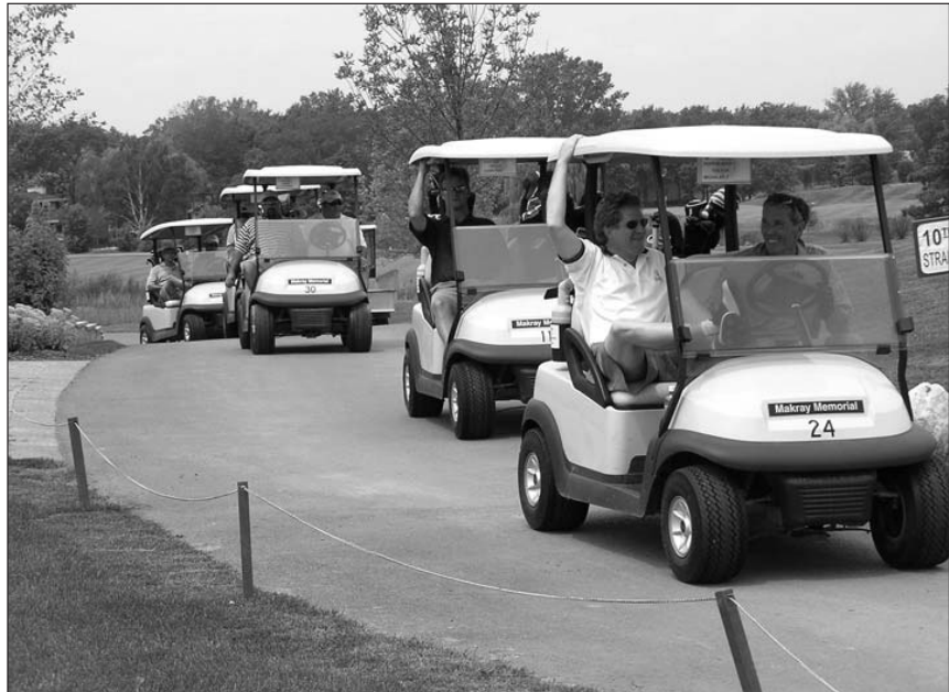
Golf carts roll along the Makray Memorial course, carrying some of the over 140 Builders Association members who helped raise money for the Builders Foundation.