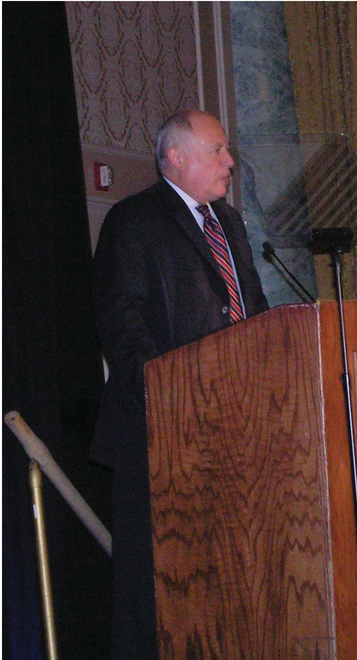
Governor Pat Quinn speaks at the Builders Association's Annual Meeting in 2009 at The Drake Hotel. Among the many pieces of legislation signed by Quinn in the most recent session was the reform of Workers' Compensation legislation.

Cuts were made to the medical or hospital fee schedule and the cost of implants.